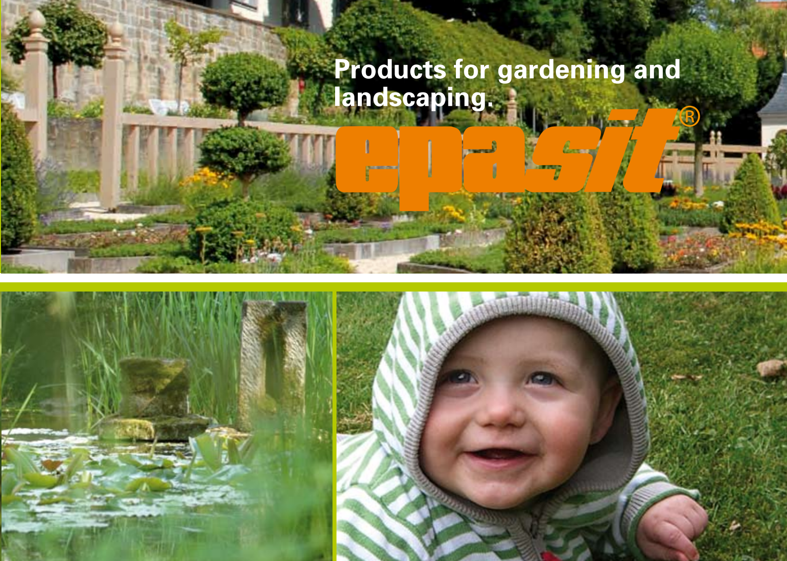
Feel good like in your holiday - with epasit